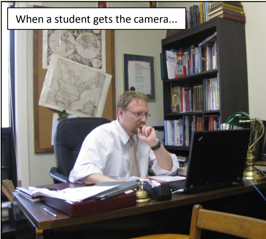
When a student gets the camera...

Have you not known? Have you not heard? The everlasting God, the LORD, the Creator of the ends of the earth, neither faints nor is weary. His understanding is unsearchable.